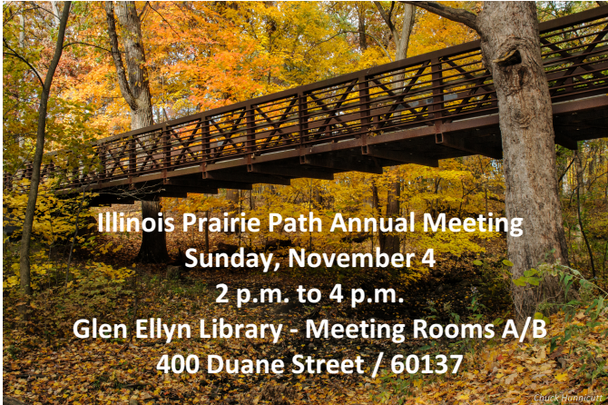
Illinois Prairie Path