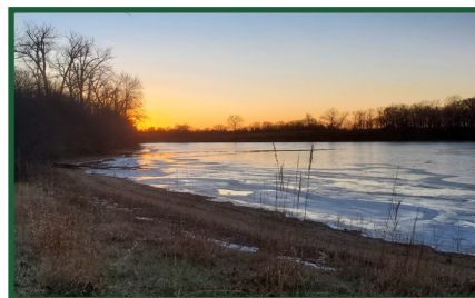
Silver Lake at Blackwell Forest Preserve in Warrenville