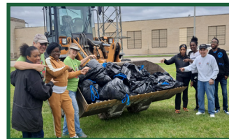
Bellwood Clean Up in 2024

Please join us! Volunteer sign-up begins March 1 at ipp.org/cleanup .