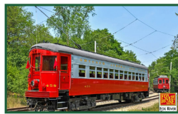
The Fox River Trolley Museum

The organization is a 501(c)(3) not-for-profit organization that is funded by the train rides and donations from folks like you. Visit them at https://foxtrolley.org or look them up on Facebook for the latest updates and information.