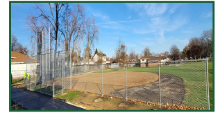
Addition to Berkeley Park

https://www.facebook.com/share/p/15wCbFLaGT/