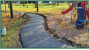
New Path at Berkeley Park

Thanks to the Village of Berkeley, the Illinois Prairie Path extension is ready for use! While the crew still has to do some work in the park, the path is paved and ready for you to try. The new loop is 0.4 miles long. We hope you are able to get out and enjoy it soon.