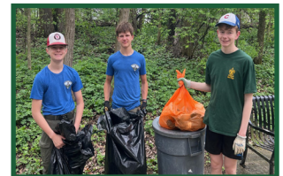
Glen Ellyn East Clean Up in 2024