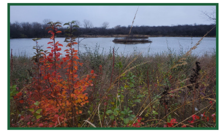
Timber Lake in Winfield