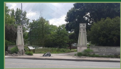
Updated IPP Trailhead at First Avenue, Maywood, IL

We hope to continue to reach out to neighboring communities and promote the value of the Prairie Path to all those living in the area.