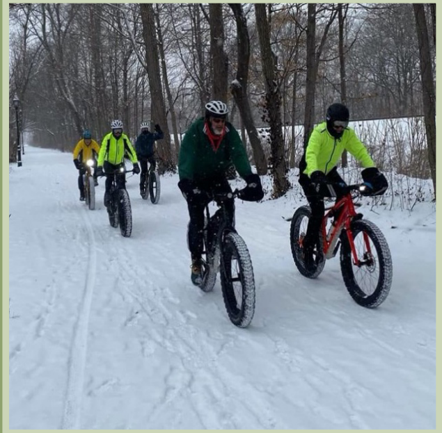
Elmhurst Bicycle Club winter ride (pictured above)