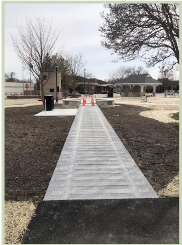
Warrenville Trailhead progress (pictured above)