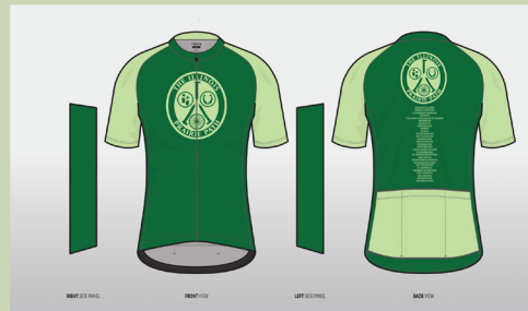
Illinois Prairie Path "inspired" bicycle jersey

J & R Cycle 240 W St. Charles Road Villa Park, IL 60181 630-620-1606 https://www.jandrcycleandski.com/