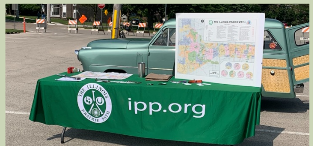
IPPc display at the Glen Ellyn Bike Rodeo

The IPPc was represented at the recent Glen Ellyn Bike Rodeo on May 20th. Sponsored by the Glen Ellyn Park District, the day's events included children-oriented bike safety activities and maneuvers. Plus, there were displays by the Illinois Prairie Path and Ride Illinois, the East Branch River Trail, Go-Green Glen Ellyn, the GE Public Library, and the GE Police Department.