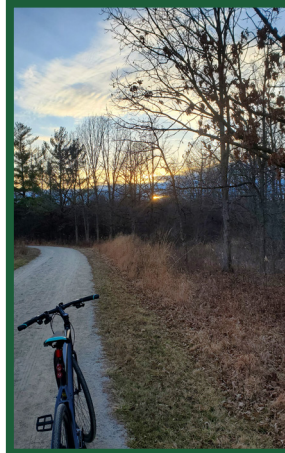
IPP Geneva Spur in Winfield