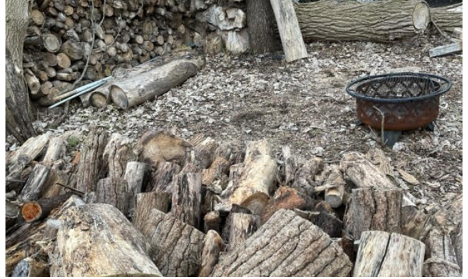
West Chicago - Little House on the Prairie