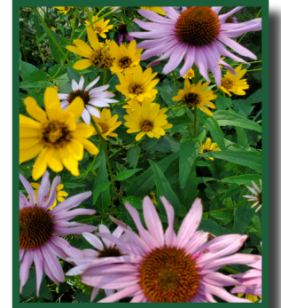
IPP Elgin Branch at Volunteer Park in Wheaton