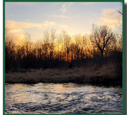
IPP Geneva Spur at the West Branch Dupage River in Winfield