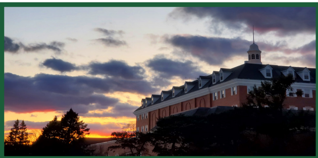
IPP Main Stem - Billy Graham Center - Wheaton College

As the IPPc continues to advocate for a path extension east to the Forest Park Blue Line CTA Station, we look forward to one day having a potentially new trail connection. Chicago riders would be able to take the train to Forest Park to enjoy the Illinois Prairie Path's 60+ miles of trails, where they can do so beginning in an Arbor Day certified community: Forest Park!