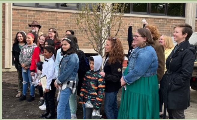
Arbor Day participants in Forest Park

On Friday, April 28th, a representative from the Illinois Prairie Path corporation participated in Forest Park's Arbor Day event. It was a great event that included singing by the local grammar school, speeches about the importance and value of planting trees, and concluded with an actual tree planting that can now be seen on the south side of the Forest Park Library.