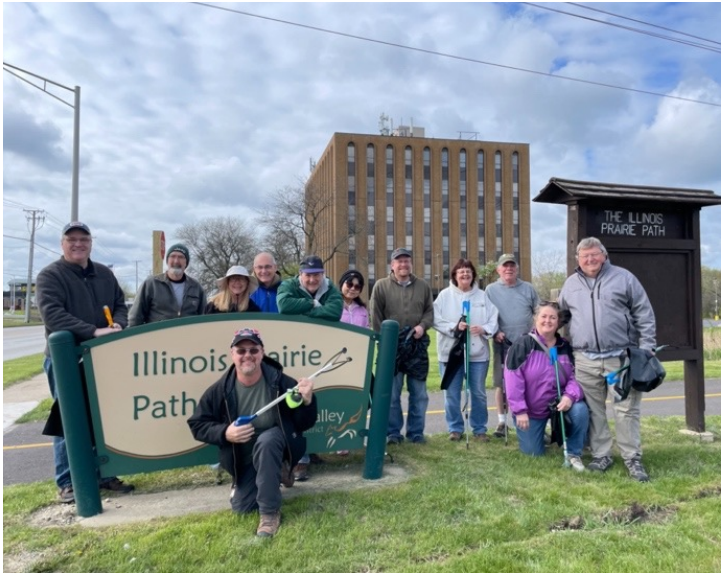
The cleanup crew in Aurora