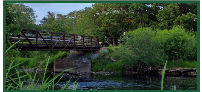
IPP Geneva Spur at West Branch DuPage River in Winfield