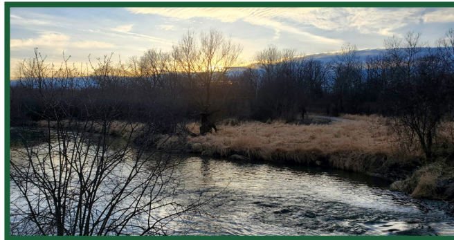
IPP Geneva Spur at the West Branch DuPage River in Winfield