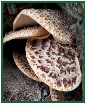
IPP Aurora Branch in Aurora