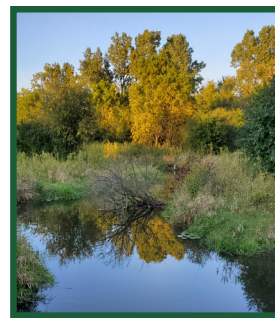
IPP Elgin branch at Klein Creek in Winfield