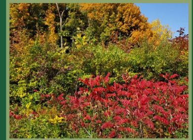
Aurora Branch vistas - continued