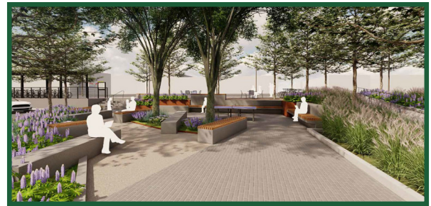
Downtown Wheaton Streetscape Renderings (above and below) (Compliments of the City of Wheaton)

Visit the City of Wheaton's website for more information: https://www.wheaton.il.us/downtownstreetscape .