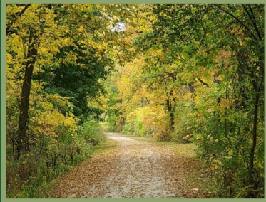
Thank goodness this branch is now open

The IPP Aurora Branch that had been closed between Molitor and Indian Trail has reopened. It has been widened and re-surfaced, drainage has been improved, and new safety railings will be placed at various locations in the fourth quarter. Proper temporary safety measures have been put in place in the meantime. This Prairie Path project is being constructed through a contract between Martam Construction Company and IDOT.