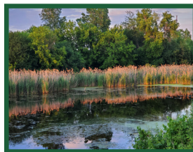
IPP Elgin branch in West Chicago just west of Prince Crossing Road