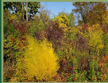
More views of this reopened branch