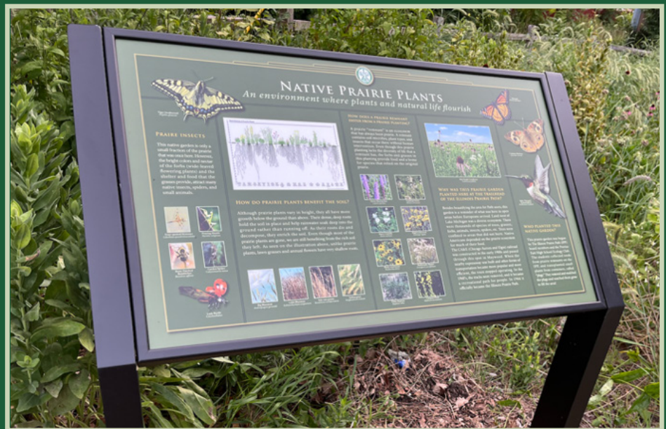
Maywood Trailhead Sign-Prairie Plantings

Some of you who start your IPP ride at the Maywood trailhead may have noticed a new educational sign posted that illustrates the importance and value of prairie plantings. For those that do visit this area, you will be greeted with a wide variety of insects that visit these plantings including many Monarch butterflies who use the many flower plantings as their fuel for their journey back south for the winter. We encourage all members to visit this area and enjoy first-hand what a prairie planting has to offer us all!