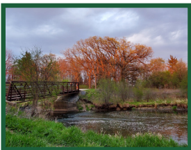
IPP Geneva Spur Winfield at the West Branch DuPage River

For now, please know that every time you pass one of our prairie plantings along the path, it is a reminder that we here at the IPP are attempting to do all we can to keep this special species along for many years to come! Our plantings help provide the food, shelter, and the milkweed host plant that allows for the Monarch to lay her eggs to continue the cycle. Thank you for being a member and supporting our efforts such as this!