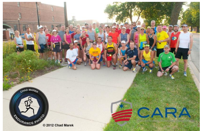
Photo of the 6:45 a.m. starters last summer (2012) on the Illinois Prairie Path sidewalk that runs through downtown Wheaton.