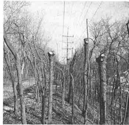
Trees under the Commonwealth Edison lines along the Illinois Prairie Path in Glen Ellyn