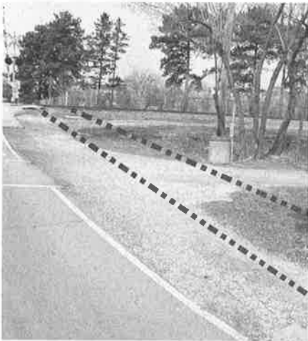
A sidewalk along Chase Street would address safety concerns