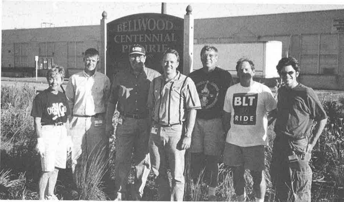
August Work Day: Borg Warner's Executive Work Day on August 13 demonstrated its commitment to the Illinois Prairie Path and the Bellwood Centennial Prairie.