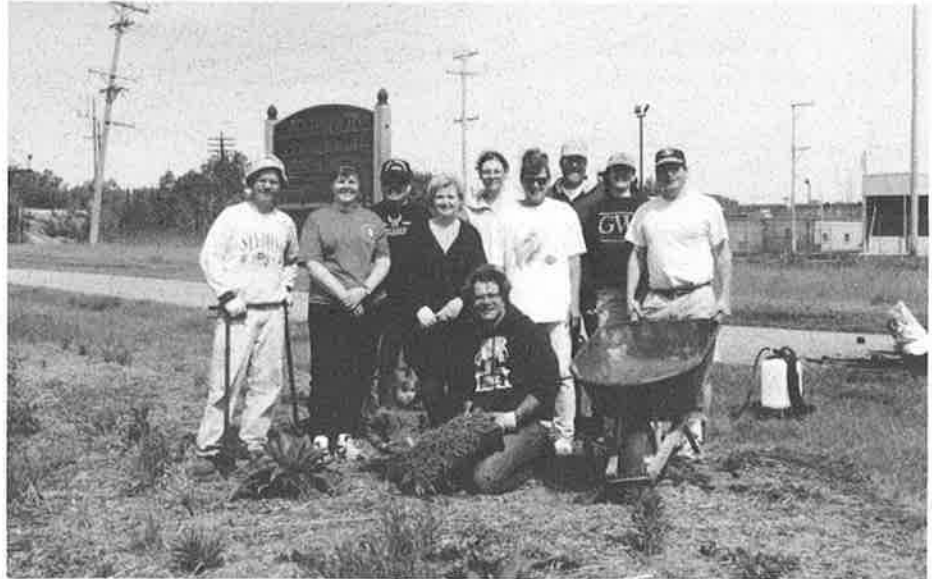
Bellwood Prairie: IPP and Borg Warner volunteers nearly doubled the size of the Bellwood Centennial Prairie on May 13.

Once again, Borg Warner Corporation graciously supported the IPP cleanup with donuts, coffee, orange juice, bags and gloves. The 2001 cleanup was completed at three locations with one group from the Boys and Girls Clubs starting in Maywood at 1 st Avenue heading west; another group starting in Bellwood at Mannheim Road and heading east; and the Borg Warner, IPP, and Morton South volunteers tackling the middle section around 25 th Avenue. The students worked in a section of the IPP that had never before been cleaned