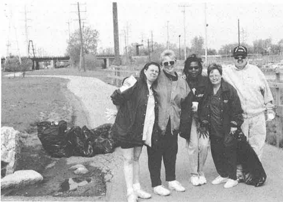
Earth Day Cleanup: Borg Warner employees helped with the IPP Earth Day cleanup in Cook County on April 28.