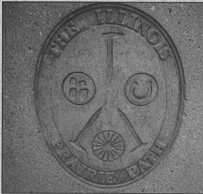
A 12-inch Illinois Prairie Path logo is distinctly cast on each of the new trash containers.

We also received some constructive criticism on the old trash barrels from a few home owners. Although the recycled 55-gallon drums were providing a very useful service they simply no longer cosmetically "fit" in the neighborhoods.