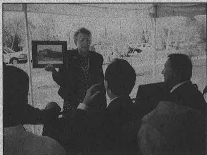
At the Arbor Day ceremony, Warrenville Mayor Vivian Lund gives a brief history of the Prairie Path and shows pictures of the old Warrenville CA&E station (now City Hall) as she congratulates ComEd for turning a lemon (the power line) into lemonade (the landscaping).