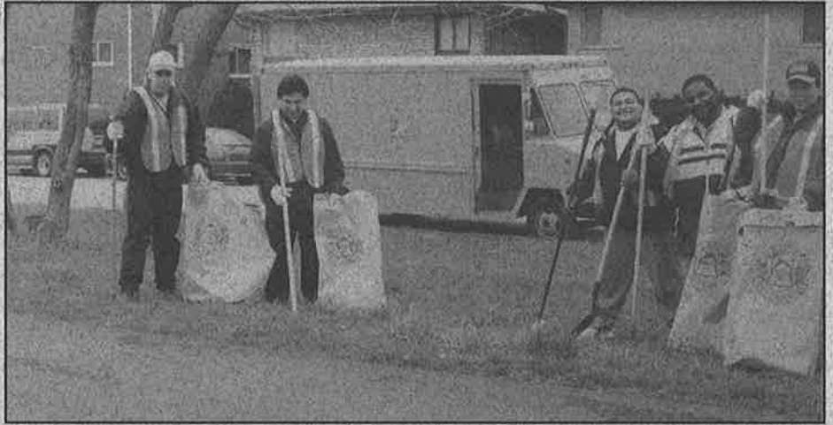
Bellwood: Community service workers did a great job cleaning up the IPP.

The volunteers also swept up broken glass. The Prairie Path Board recommends to the municipalities that they adopt a regular trail-sweeping program.