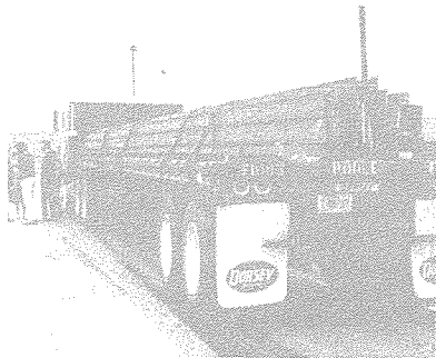
POOLE TRUCK LINE DELIVERS STEEL BEAMS TO DAVEA.